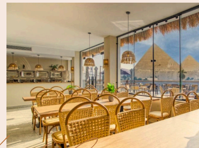
Pyramid View Hotel, Cairo