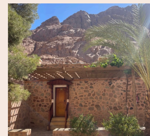
Sainte Catherine Monastery