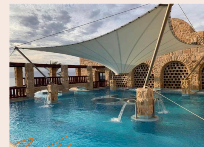
Dead Sea Private Villas