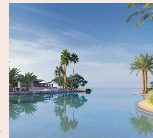
Movenpick Dead Sea