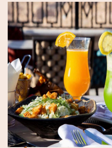
Petra Moon Luxury Resort